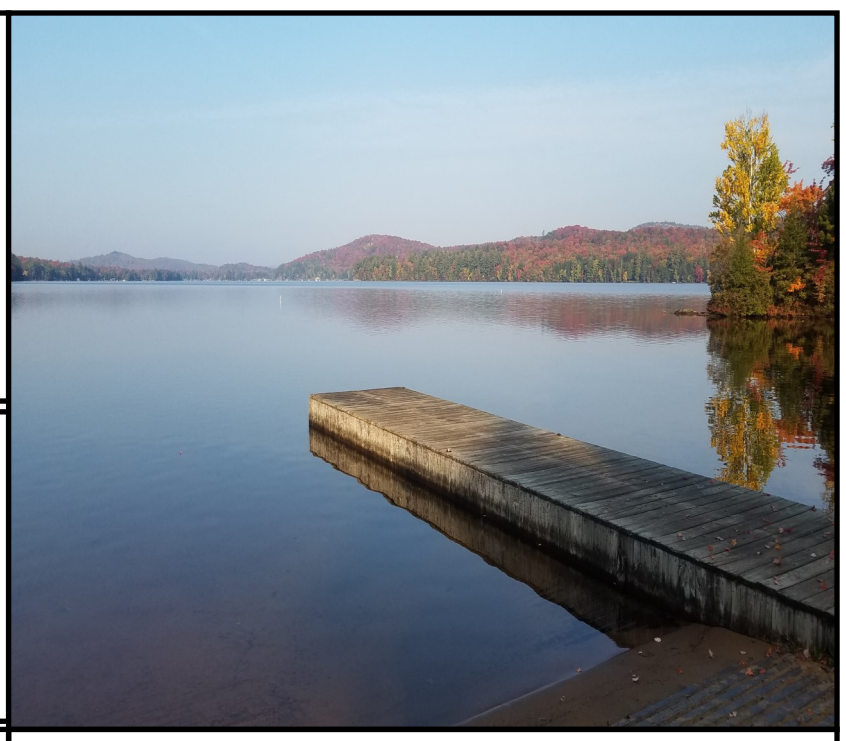
Autumn, 2020 Seventh Lake, Inlet, NY

Facebook: <a href="https://www.facebook.com/pages/">www.facebook.com/pages/</a> UU-Central Square/199139743511564