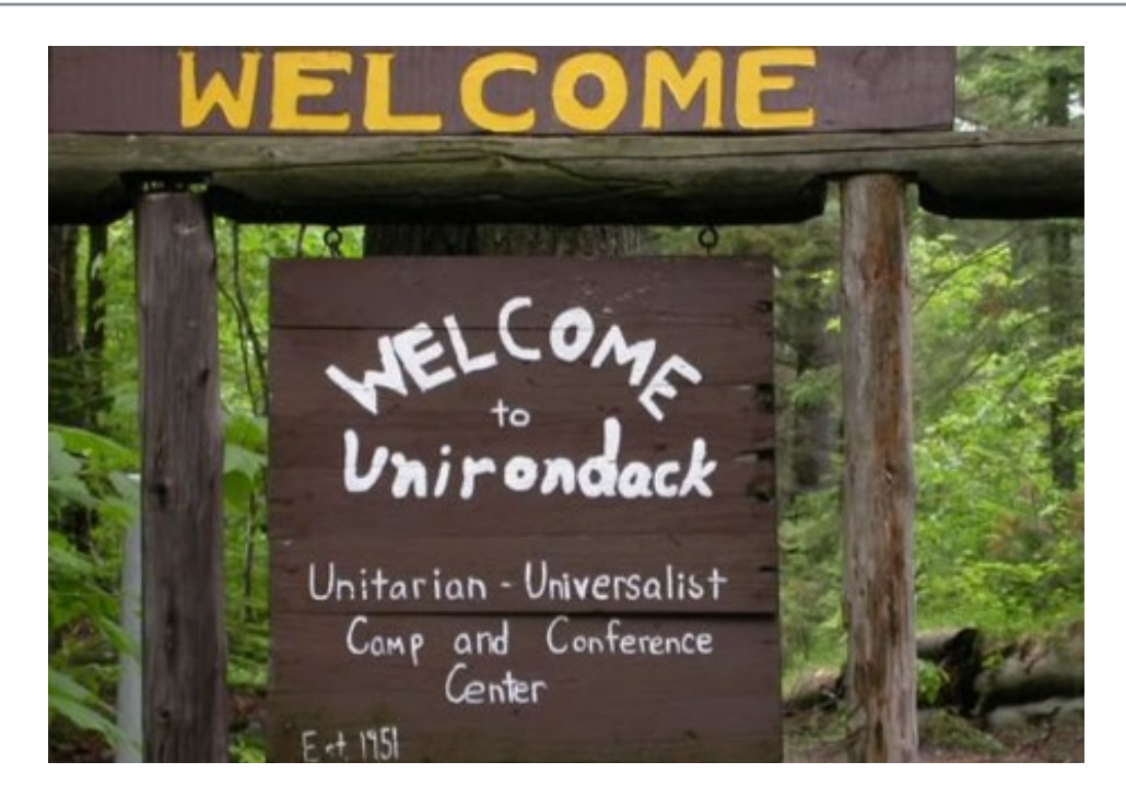
UNIRONDACK: A SPECIAL PLACE

The living tradition which Unitarian Universalists share draws from many sources, including words and deeds of prophetic women and men which challenge us to confront powers and structures of evil with justice, compassion, and the transforming power of love.